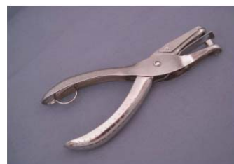
6mm Hole Punch

Warranty: Wilshire Works Inc. warrants that for a period of five years from the date of purchase, solid ribbons, attachment and bangle hardware will be free from defects in material and workmanship. Wilshire Works' warranty is limited to replacing, at its discretion, the defective pull or any component of the product during the warranty period. Wilshire Work's Inc. distributors do not have the right to alter, modify or in any way change the terms and conditions of this warranty. This warranty does not cover normal wear of the product or damage resulting from any of the following: negligent use or misuse of the product, or use contrary to the specified instructions. Please note: Wilshire Works Inc. will not be held liable for death or damages directly or indirectly involving any Sanipull product.