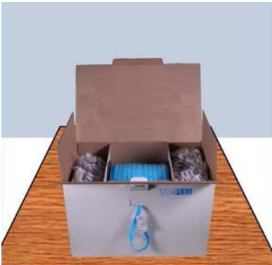
New 300 metre Reels

Sanipull® is a cleanable replacement pull system for switches commonly found in healthcare facilities, care homes, and public toilets, on lights, alarm stations, nurse calls, and patient lifts. Sanipull replaces unsanitary cords with a user-friendly vinyl ribbon profile pull and is a proven solution in over 1000 North American facilities (client list at www.Sanipull.com ). It can be easily attached to any switch with an adaptor or removable Sanipull spring clip.