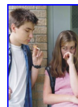
“Smoking in School is not permitted”

http://www.youtube.com/watch?v=PBDwiLzDVVU