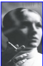
“Please do not smoke in this area”

See how Cig-Arrête® Tobacco Detection Systems can work for you by viewing our demo videos at: